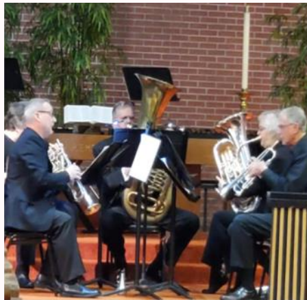
Featuring musicians from Crossroads Brass!